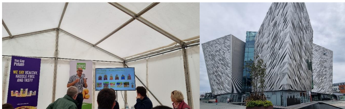
Figure 5. Technical tours: Wilson's Country and Titanic Museum.

The last day was dedicated to the technical tours. There were different options, and I chose to visit Wilson's Country, Ireland's leading potato brand, which gave me an overview of the potato market in Northern Ireland, the Republic of Ireland and Great Britain. The next stop of the tour was the famous Titanic Museum in Belfast. It was a really nice day where I still got to know more people in the sector, and I learnt a lot!