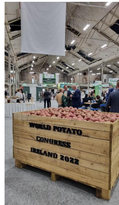
Figure 1. Venue of the World Potato Congress Ireland 2022 - Royal Dublin Society.

The project I am working on is entitled “Reducing potato losses by creating a predictive model for black dot disease”. It is a 3-year project and co-funded by Albert Bartlett, one of the biggest suppliers of fresh potatoes in the UK, and Cranfield University. Currently, I am in my second year of this journey, and I could not be happier!! I am mainly looking at different pre- and postharvest