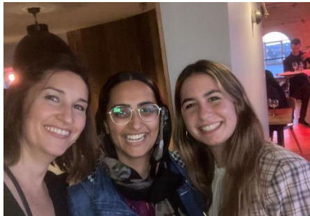
Figure 4. Conference dinner in the Guinness factory.

I have to say that organisation of the Congress was impeccable! We had a 2km fun run (it was at 6:30am in the morning) but it was worth it! The weather was nice, so we enjoyed it, it was a great start to the day! The conference dinner was held in the Guinness factory in Dublin, which was