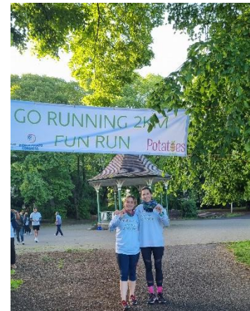
Figure 5. Fun run 2km.

wonderful! We had amazing views and we learnt a lot about the beer process (so not everything during the conference was about potatoes...!).