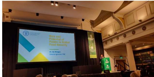
Figure 3. Dr Qu Dongyu, Director General of the Food and Agriculture Organization of the United Nations, in the WPC 2022.

The first day of the conference we had the registration and interesting plenary sessions. We had the chance to listen to Dr Qu Dongyu, Director General of the Food and Agriculture Organization of the United Nations.