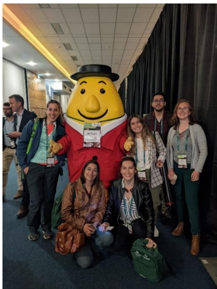
Figure 4. Networking - with Mr. Tayto.

On the second and third days we attended the talks; the topic of the conference was “The Changing World of the Potato”, so the talks were about the future of the potato, taking into account all the challenges the world is facing right now. Some of the sessions were really to reflect and think. We had also the technical talks and I was amazed on how much research is going on! It was useful to learn what the state-of-art of the potato research is. Also, we had poster sessions where I met people who are the authors of the papers I have been reading so far, which was exciting! I think it is